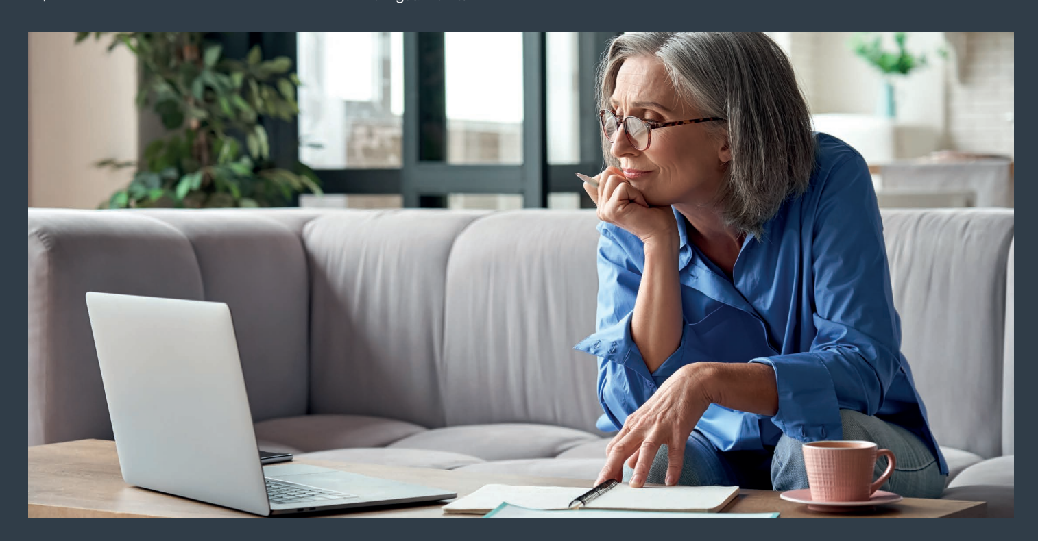
The value of pensions and investments and the income they produce can fall as well as rise. You may get back less than you invested. Past performance is not a reliable indicator of future performance. Investing in shares should be regarded as a long-term investment and should fit with your overall attitude to risk and financial circumstances. Occupational pension schemes are regulated by The Pensions Regulator. Equity release will reduce the value of your estate and can affect your eligibility for means test.

For advice tailored to your circumstances, please contact us.