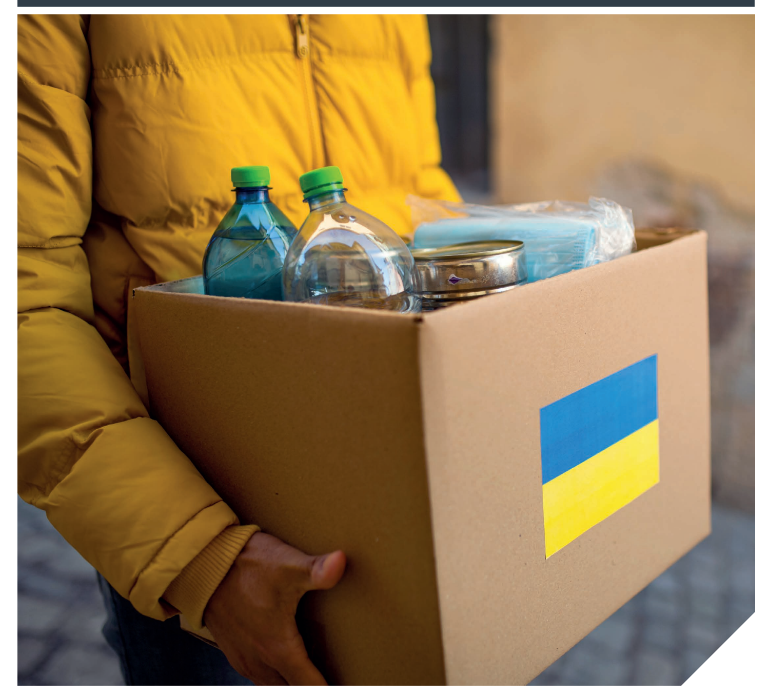
The war in Ukraine and cost of living crisis have prompted many people to donate to charities helping those affected. Various schemes are available to boost the value of your charitable donations.